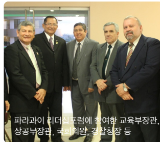
파라과이 리더십포럼에 참여한 교육부장관, 상공부장관, 국회의원, 경찰청장 등