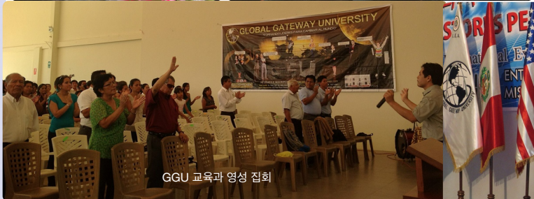
GGU 교육과 영성 집회