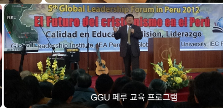
GGU 페루 교육 프로그램