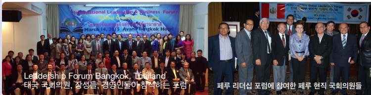
Leadership Forum Bangkok, Thailand 태국 국회의원, 장성들, 경영인들아참석하는 포럼

(study tour Global Christianity) RE 890 Major Research Dissertation. 6 CP 832 Capstone (Graduation Seminar) 3 Total 39 Credit Hours