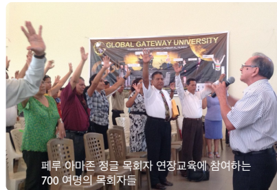
페루 아마존 정글 목회자 연장교육에 참여하는 700여명의 목회자들

# CP 650 Capstone (Graduation Seminar) Total 36 credit hours