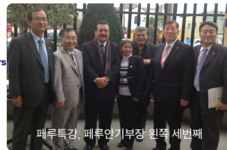
페루특강, 페루인기부장 왼쪽 세번째