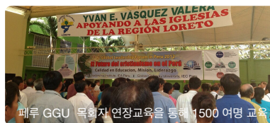
페루 GGU 목회자 연장교육을 통해 1500여명 교육